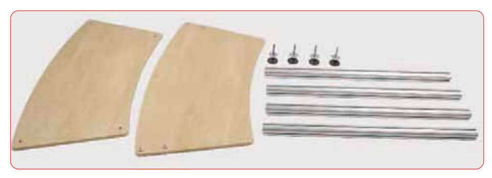
Kit Includes: 1x table top, 1x base, 4x linear 50mm round post, 4x adjustable feet, 6x wing extrusion