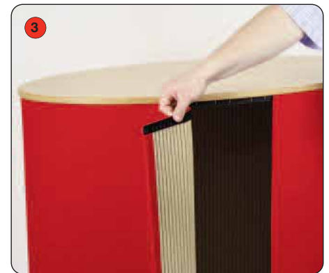
3 Carry on securing the wrap to the top and the base until it meets up.