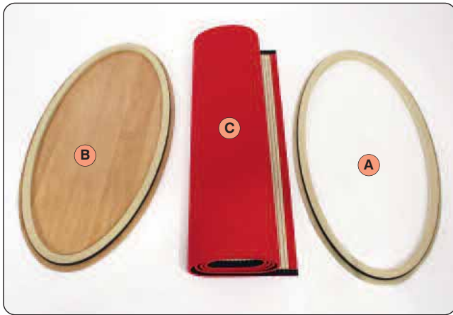
Kit includes: Outer wrap (A), top (C) and base (D)