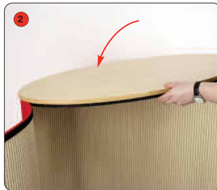
2 When the wrap is half way around the base, place the top (B) carefully on, securing it against the hook fastener strip on the wrap.